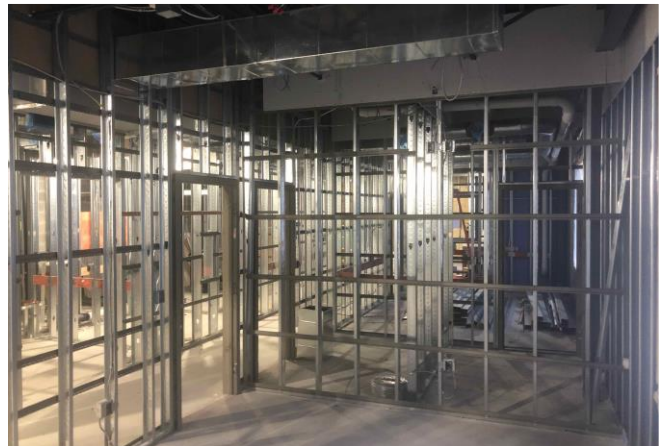
Installed ductwork in Addition C