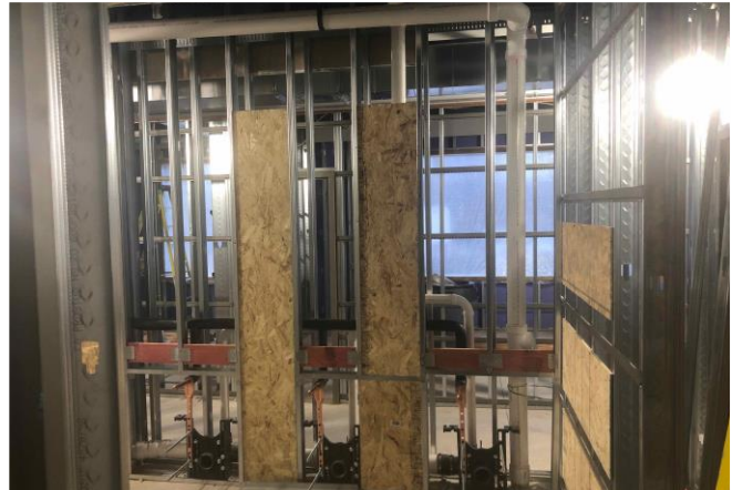
Installed blocking at Addition C Restrooms