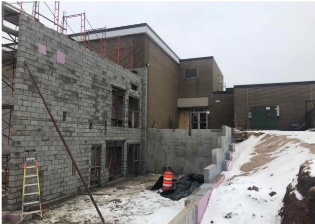
Continued masonry at Addition C